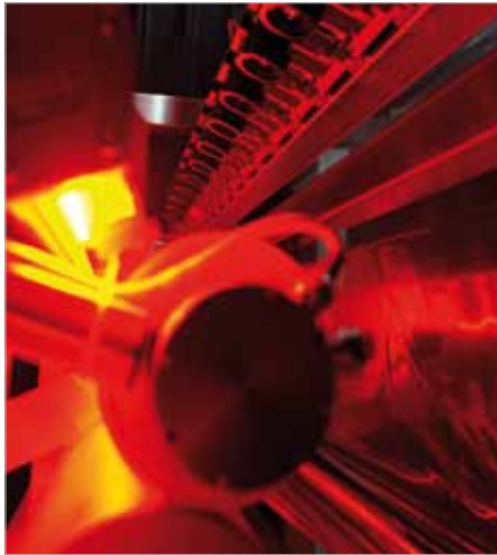
Dr. Schenk solution for film inspection

The combination of film extrusion with the cast step is one of the most versatile and prevalent film manufacturing methods. Particularly for sophisticated multi-layer films, cast extrusion is the method of choice. Converting steps, such as stretching, coating, sputtering and laminating, are frequently part of the production line, which commonly runs 24/7 with product changes performed on the fly. At the end of the line, prior to the winder and the automatic roll-cutting system, film inspection must continuously identify a variety of defects and feed this quality information back to each of the diverse production steps.