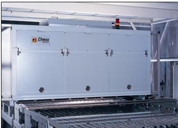
Figure 1: High resolution inspection system Chess for optical inspection of thin glass, e.g. used for flat panels

Inspection systems in the glass field are becoming more and more indispensable, as the sizes of glass substrates increase simultaneously with their quality requirements. The answer to these needs is given with automated surface inspection, which enables a 100% inspection after each relevant production step. On-line integration allows faster feedback in only a few seconds, and moreover, the accumulation of all inspection data compiled in a production process overview. Automated inspection systems applied in a production line are laid out to accumulate, analyze and display all inspected data on one single monitor, providing immediate process feedback to achieve a reliable process control.