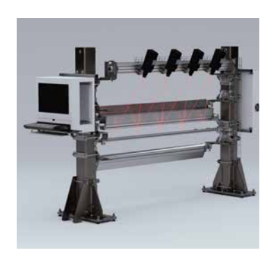
A Dr. Schenk EasyInspect solution (exemplary image of a 4-camera configuration as may be used in plastic film inspection)