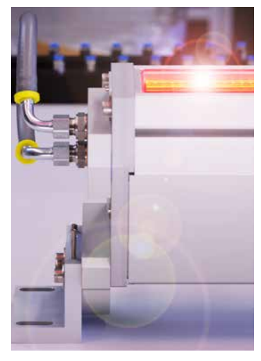
Dr. Schenk Sirius Light Technology (SLT) delivers more light to the material surface

Defects and measurements are probably common knowledge. But what exactly do you mean by "material properties"?