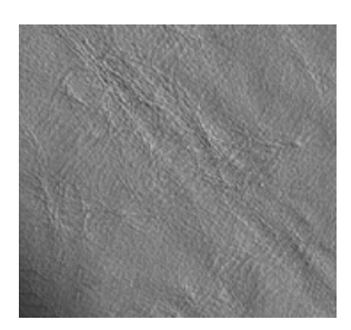
Example: loose grain defect in a cow hide difficult to see with the naked eye (above), far easier to detect using high-speed cameras and dedicated illuminations (below)