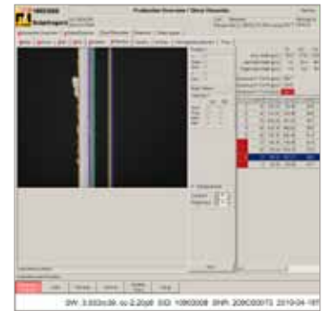
Screen shots of scribe defects: Discontinuities in scribes will result in short circuits