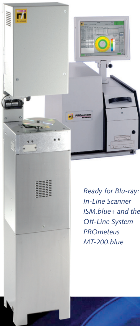
Ready for Blu-ray: In-Line Scanner ISM.blue+ and the Off-Line System PROmetheus MT-200.blue