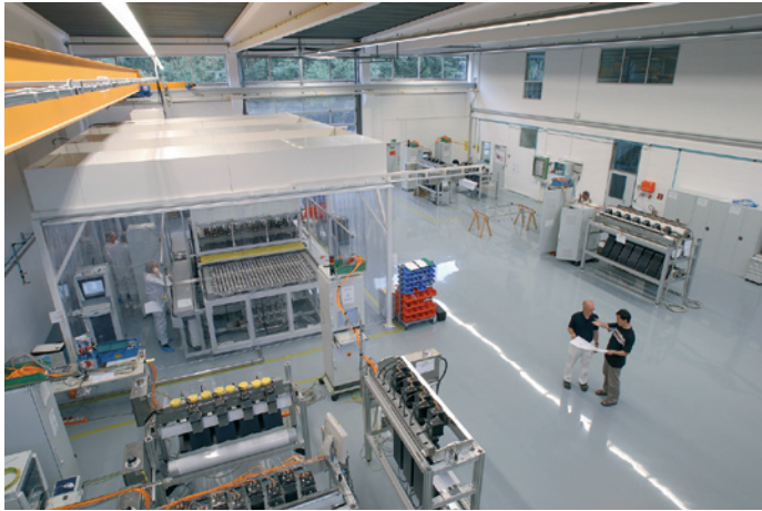
Dr. Schenk's modern production site

Dr. Schenk GmbH, established in 1985, is an innovative high-tech company based in Munich, Germany. For the third decade now, the range of products and services offered by Dr. Schenk comprises comprehensive solutions for automated quality assurance and production process monitoring to the optical media, flat glass, film and foil, converting, paper, solar and semiconductor industries. In these areas Dr. Schenk continues to set new standards for the inspection of surfaces through the utilization of the latest technical advances in optics and electronics.